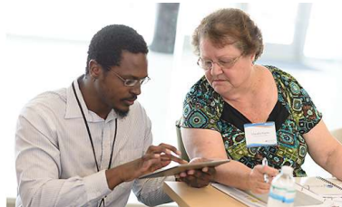
UF receives $17.5 million to speed discoveries toward better health