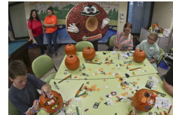
Doughnuts, pumpkins and smiles at UF Health Shands Children's Hospital