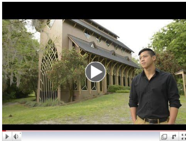
University of Florida Research Landscapes