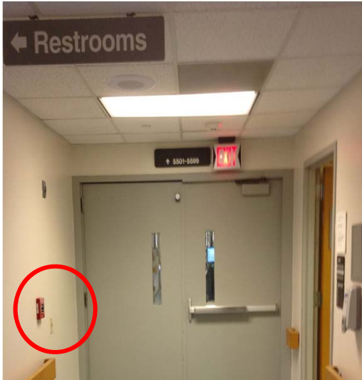
Pull stations are located near exits