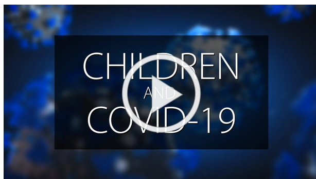
COVID-19 In Kids