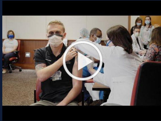
First COVID-19 Vaccine in Gainesville Florida